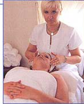
Japanese silk booster facial

HB Health of Harley Street 112, Harley Street, London W1. Tel: 020 7323 1388 Fax: 020 7323 1387 Opening Hours: Mon - Friday, 9am - 6pm, Evenings and Sat by Appointment