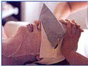
Japanese silk booster facial

HB Beauchamp Place uses the La Prairie Facial Range, and Elemis products for its holistic beauty treatments, and offers the extensive range of Elemis Treatments from traditional therapies such as aromatherapy facials, massage and Exotic body wraps, to the exclusive Aromastone Massage using Hot Basalt Volcanic stones to deeply relax and warm the muscles, creating a feeling of calm and well-being. The Fennel Cellulite and Colon Cleanse is the perfect accompaniment when following a detox package or trying to embark on a healthier lifestyle. Both of these treatments are only available within selected Elemis Lifestyle Centres within the United Kingdom. The clinic has recently introduced the La Prairie Facial range, which allows the therapists to offer results-orientated facial treatments, without having to compromise the luxury of a manual facial, providing the elusive combination of instant results and relaxation.